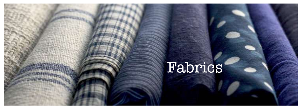
We manufacture all types of Mill-made, Wovens, Knits, Autoloom & Handloom fabrics. ({\tt Cotton}\,,\,{\tt Rayon}\,,\,{\tt Viscose}\,,\,{\tt Silk}\,,\,{\tt etc.....})